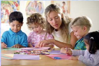
Head Start Fall 2017 vs. Spring 2018 Child Outcomes/ Kindergarten Readiness

The education staff, in partnership with parents, set age and skill appropriate goals for the children, using an observation-based assessment tool (DRDP-2015). The DRDP-2015 is a developmental continuum and is used to assess both Early Head Start and Head Start children. The assessment is completed three times a year to measure child outcomes success to ensure children leave the program ready for school.